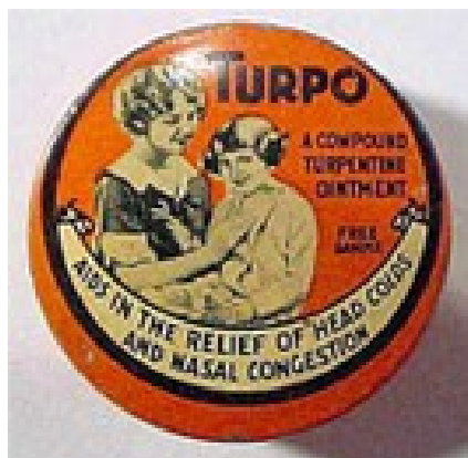
Glessner Company Turpo Free Sample Ointment Tin

In short the \alpha - and \beta -pinenes eliminate many bacteria and fungi. Turpentine also looks very promising in eliminating Candida , a yeast organism that apparently is found in most people.