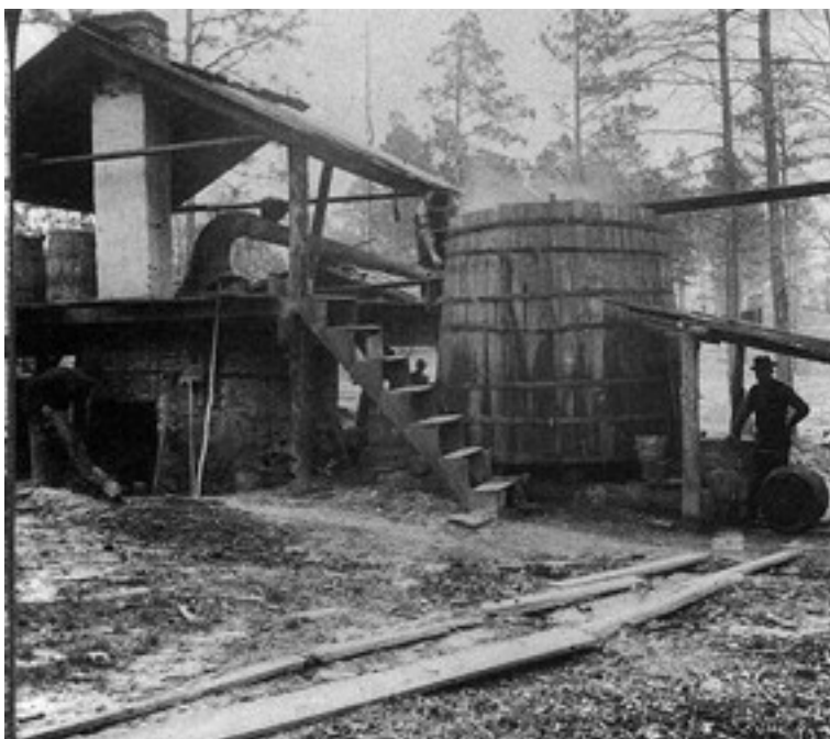
Distilling turpentine from the crude resin in the pine forests of North Carolina 1903

There is a very nice article about the history of turpentine harvest and distillery at the DaysGoneBy website with a lot of old pictures.